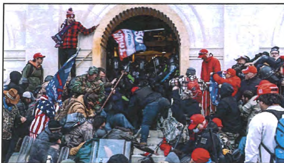
Photograph of the Capitol on January 6, 2021 115