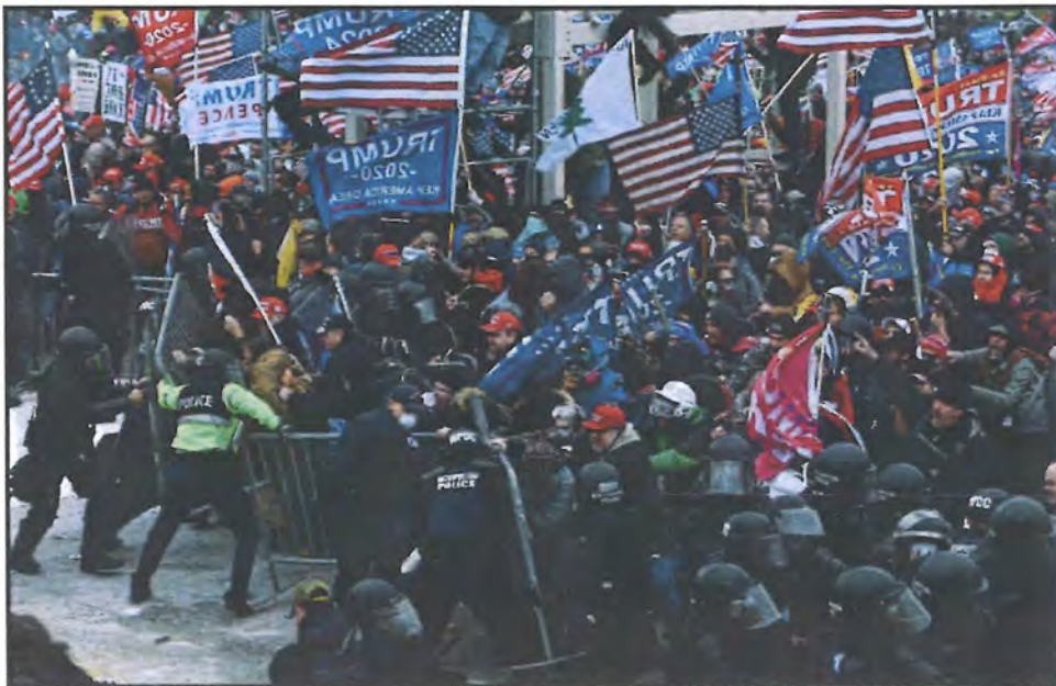
Photograph of the Capitol on January 6, 2021 117