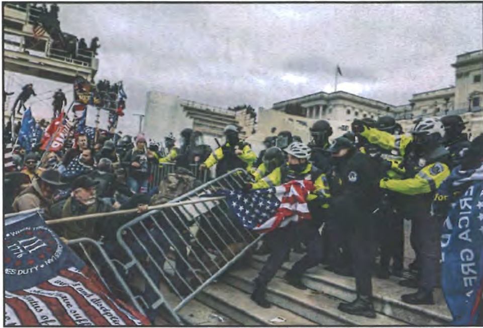
Photograph of the Capitol on January 6, 2021 116